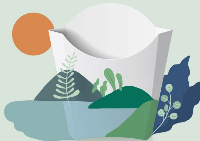
Tavola Rotonda a cura di Trasformatori, Designers, Brand